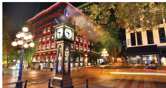
Vancouver's neighborhoods are diverse and rich with culture.

All agents with a minimum of $225,000 in production credits will be able to bring one qualifier and a guest.