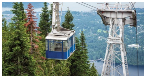
See jaw-dropping views from the summit of Grouse Mountain